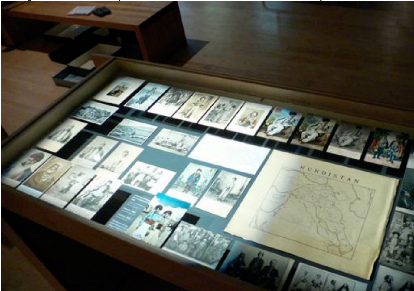
"Kurdistan In the Shadow of History", Susan Meiselas (archive founded in 1992, shown at ICP, Fall 2008).

new archival contract, “signed” by users without the sentries’ consent. Here are a few more examples among many. The archive Kurdistan , created by Susan Meiselas, who insisted on restoring that which had nearly disappeared inside the imperial narrative, and later the national one, while turning the archive into a platform for the rehabilitation of a community.