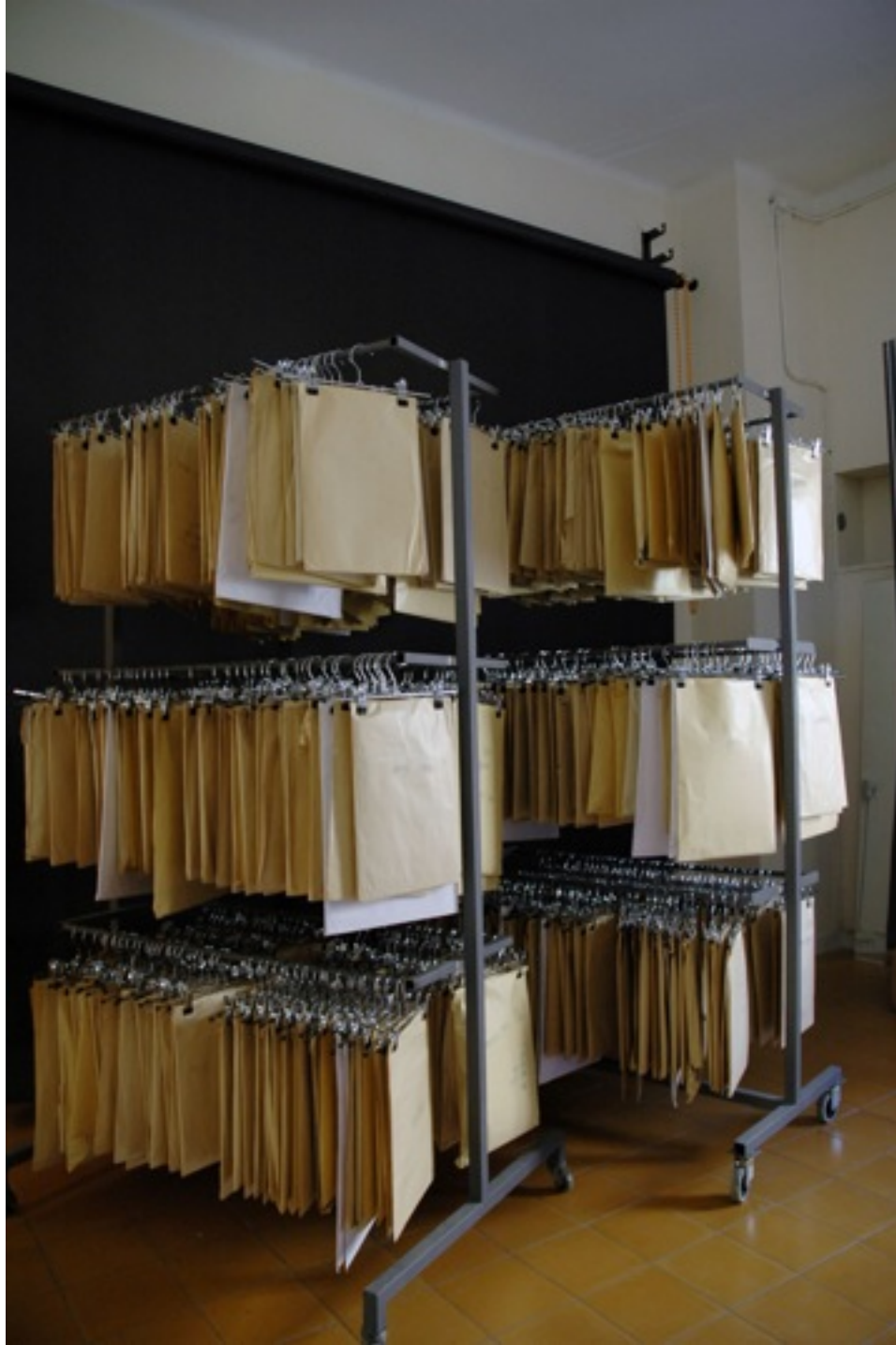
Michal Heiman, Photographer Unknown Archive (founded in , Tel Aviv) Or the effort to re-define the borders of a realm of knowledge, such as architecture, not from the point of view of its sovereign agents, who guard the borders of its objects, but rather from a space of relationship that these objects create and operate—the way Zvi Elahyani does in the Israel Architecture Archive.