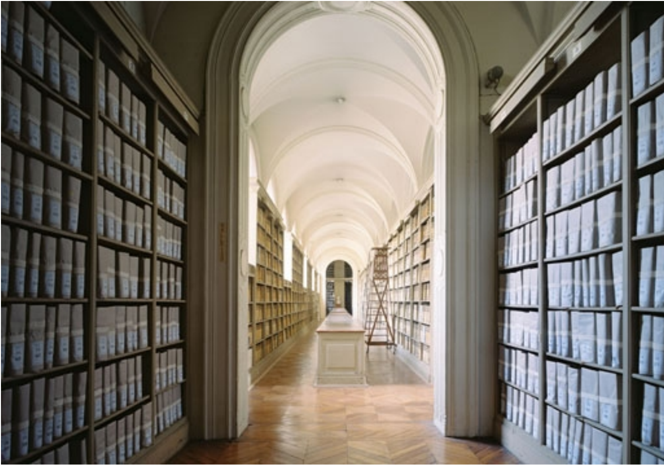
Archives Nationales, Paris, 2004, photographer: Patrick Tourneboeuf.

otherwise. Yet even when the archive is fully lit and relatively flat, such a view of the archive is either invented or sought after. The second kind of archive, on the other hand, is more concrete. Its depiction is interwoven with the presence of those who occupy various positions of power, authorizing them to both preserve and expose materials, as well as with the presence of those who come to leaf through those materials. In his book Archive Fever , Jacques Derrida presents the figure of the archon , guardian of the documents, the sentry, as one of the three pylons supporting the archive. The other two are the place and the law. The discussion of sentries enables Derrida to slightly reduce the abstractness of the archive, and to speak of figures of power that legislate, repeat their law, and enforce it. However, the way he looks at the sentries from the outside, as those who set archival borders, allows them to fool him at times: to force him to look at the threshold from their point of view, namely inward, at the way in which they uphold the law of the archive, leaving Citizen Derrida and his fellows outside, beyond the conceptualization of the archive. Yet Derrida, in his turn, fools them, writing that: "It is a question of