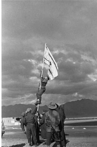
Ink Flag

The denotation “This is victory” assumes that we are facing a photograph of determination in a war that took place between two sides. The repetition by a spectator of the same denotation is supported by previous visual images of victory, such as that of soldiers hoisting a flag up a pole, which has become institutionalized as an icon of victory. In the case at hand, there is a concrete visual reference—the famous photograph from Iwo Jima signifying the American victory over Japan at the end of World War II. This reference was already in the mind of those who hoisted the flag at Um Rashrash. 7 Attaching the concept “Victory” to the photograph produces a referential circle in which the concept—victory—indicates the image and the image points back at the concept—victory is victory is victory. One thus forgets that a photograph is an image produced from within a shared reality. Its preservation as “victory” means first and foremost the distancing from the archive of those for whom it was not a matter of victory to begin with.