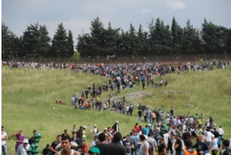
Northern Israeli Border, Nakba Day, 2011

If we look at these people again in the next photograph, this time from the point of view of the sentries who are awaiting them, the sense of their presence changes immediately. Now they are likely to be classified as “infiltrators,” breaching the law of a sovereign state, or even as terrorists. The photograph, taken in the northern border of Israel, on May 15, 2011, the Nakba day, shows Palestinian refugees and their descendants trying to return to their homes.