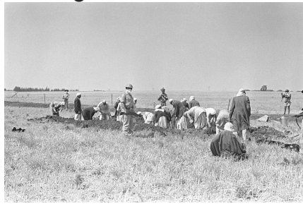
Afula, “Arab citizens harvesting crops in the fields; Haganah members guarding them”, Photographer: Fred Chesnik, IDF and Defense Archive, 1948

being attached to her/him. But it can also violently constitute the photographed person through a category that shapes her/him in its image, thereby deciding the fate of the photographed person in a way that fuses together image, concept and reference. These three types of iconization are distinguished by the power exerted in the iconization process, in the fusion of the proper name with the reference, in the distancing, sharing or excluding of some of the viewers, in the sharing, considering or disregarding of the referent—the photographed person—as partners in the archive and in the operation of the items collected in it. The latter type of iconization, produced through constituent violence, creates communities and destroys others, decides fates, contests certainties, sabotages, destroys, rescues and challenges.