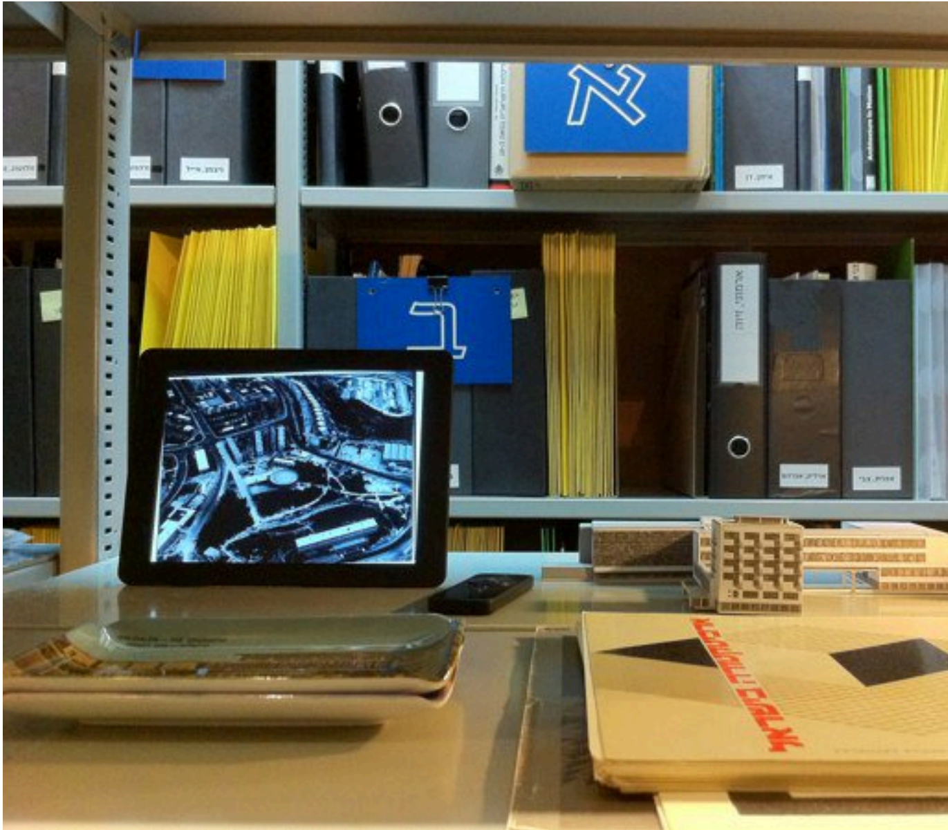
Israel Architecture Archive (founded in 1991, Tel Aviv), photographer: Zvi Elhyani Or creating a shared film archive, an Israeli/Palestinian one for example, reconstructing the fact that Israelis and Palestinians are inseparable “Siamese twins,” as Eyal Sivan did.