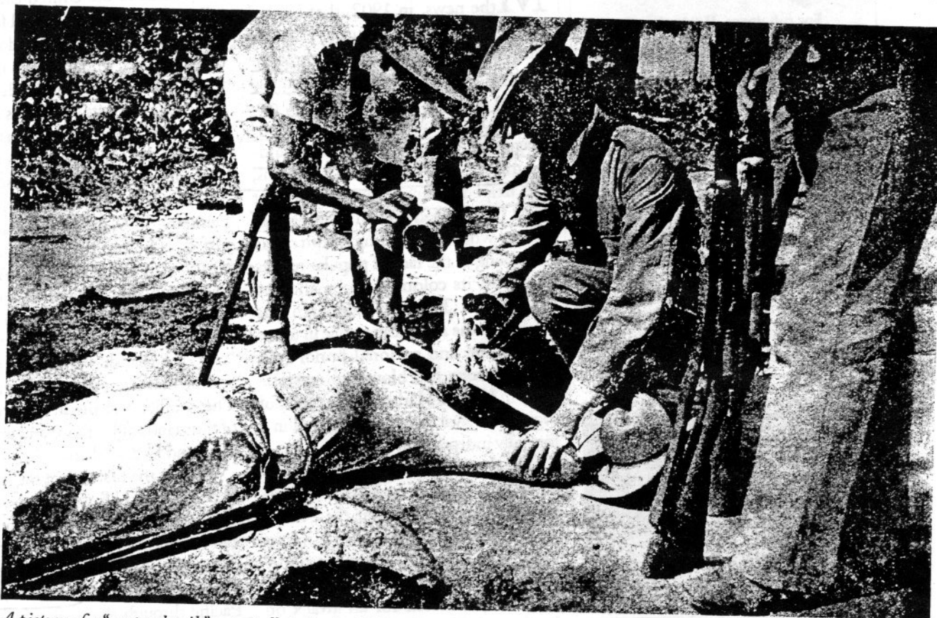
A picture of a "water detail," reportedly taken in May, 1901, in Sual, the Philippines. "It is a terrible torture," one soldier wrote.

entangled in the 1900 Presidential campaign. As the Democratic candidate, William Jennings Bryan, clashed with the Republican incumbent over imperialism, which the Democrats called "the paramount issue," critics of the war had to defend themselves against accusations of having treasonously inspired the insurgency, prolonged the conflict, and betrayed American soldiers. But, after McKinley won a second term, the critics may have felt that they had little to lose.